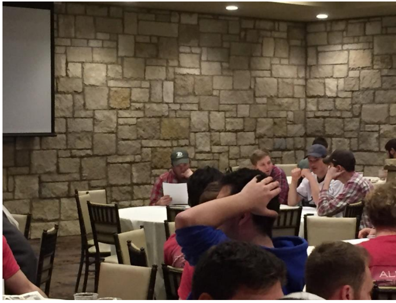
Chi Upsilon Brothers at AEPi Conclave at KU in February 2017