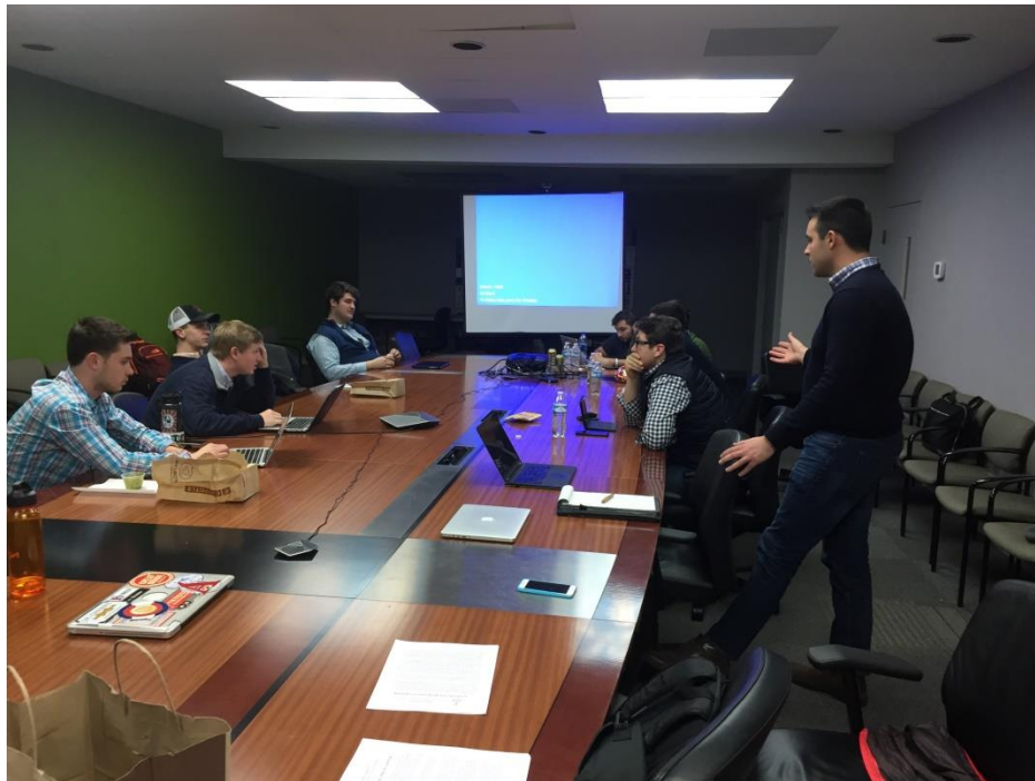
Advisers and Chapter E-board at a retreat funded by the Chi Upsilon Foundation in January 2017